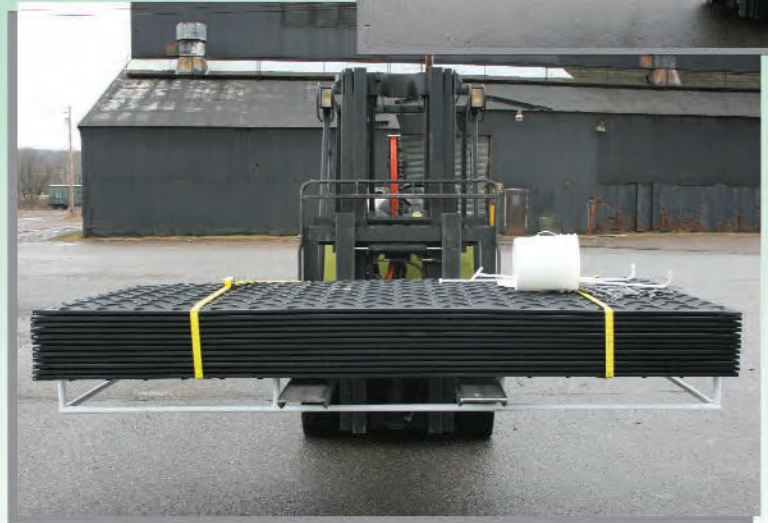
Mat-Paks load from either end or either side