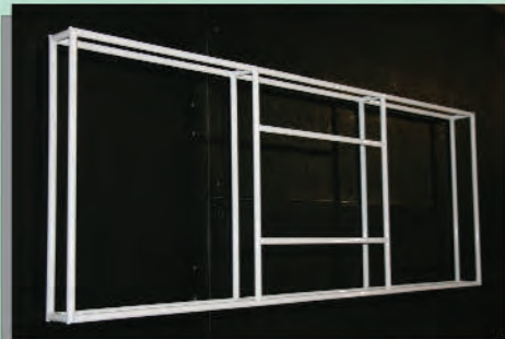
Metal Transport, Storage Skid Rack Fork lift can enter from all sides