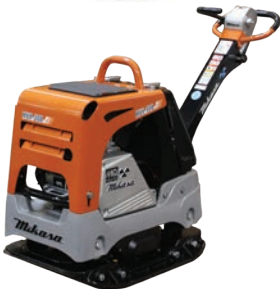
Plate size WxL in. (mm) - 19.7x28.3 (500x720) Centrifugal Force lbs. (kN) - 8,318 (37) Exciter Speed VPM - 5,200 Operating Weight lbs. (kg) - 463 (210) Max travel Speed ft/min (m/min) - 85 (26) Cyclonic Pre-Cleaner - Triple