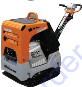
Plate size WxL in (mm) - 24x34 (600x860) Centrifugal Force lbs. (kN) - 10,116 (45) Exciter Speed VPM - 4,400 Operating Weight lbs. (kg) - 794 (360) Max travel Speed ft/min (m/min) - 79 (24) Cyclonic Pre-Cleaner - Single