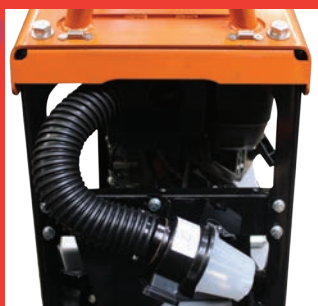
Cyclonic pre-cleaner - significantly reduces maintenance frequency and prolongs maximum efficiency of engine.