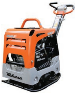
Plate size WxL in (mm) - 16.9x27.6 (430x700) Centrifugal Force lbs. (kN) - 6,070 (27) Exciter Speed VPM - 5,400 Operating Weight lbs. (kg) - 308 (140) Cyclonic Pre-Cleaner - Triple Optional Wheel Kit - WHL158