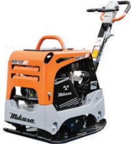
Plate size WxL in (mm) - 15.8x23.2 (400x590) Centrifugal Force lbs. (kN) - 5,283 (23.5) Exciter Speed VPM - 5,400 Operating Weight lbs. (kg) - 268 (122) Cyclonic Pre-Cleaner - Triple Optional Wheel Kit - WHL158