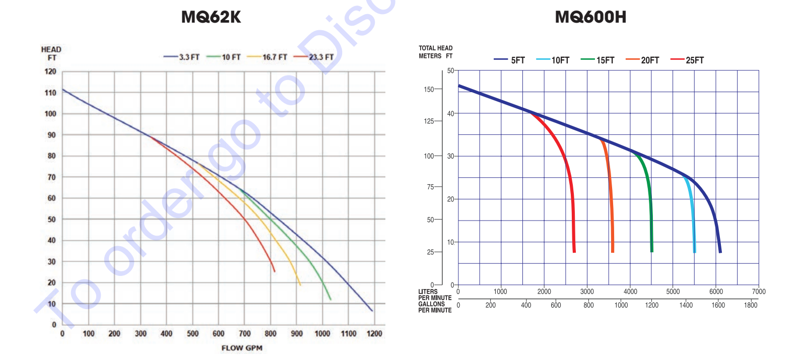
Note - The curve data represents the designed performance of the pump models, but does not take into account the many natural physical forces that act upon the pump in supporting the job.