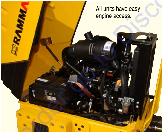
All units have easy engine access.