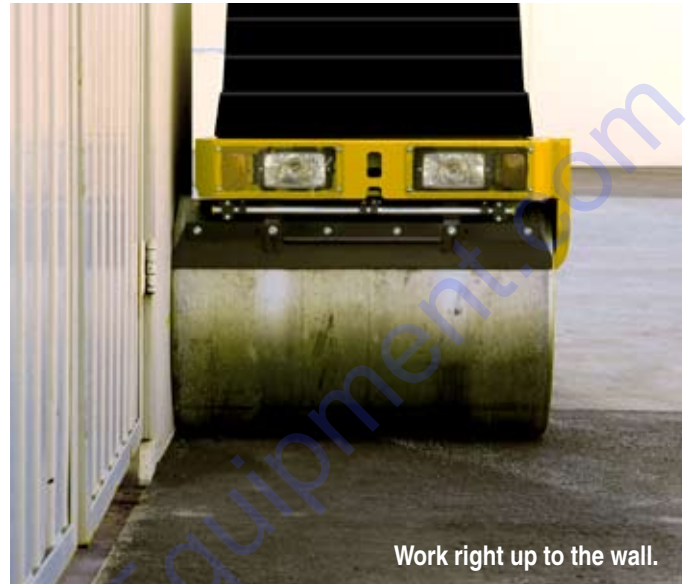
Work right up to the wall.