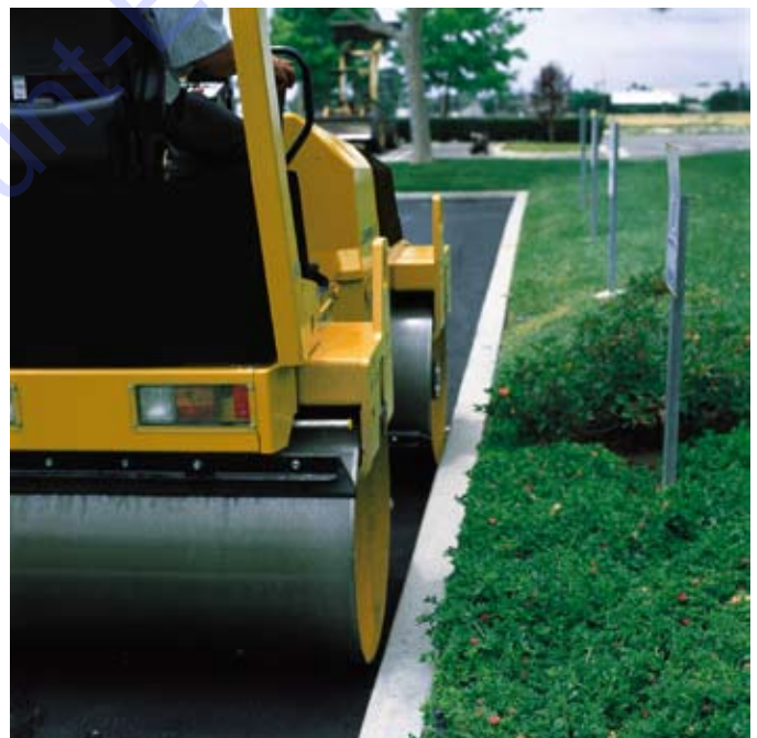
Offset drums allow close operation against walls and curbs and increase the working width of the machine.