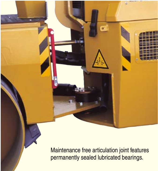
Maintenance free articulation joint features permanently sealed lubricated bearings.