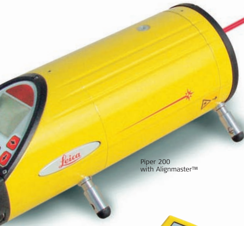
Piper 200 with Alignmaster™

Piper 200 with Alignmaster™ Patented automatic targeting system searches and finds the target for second day setups.