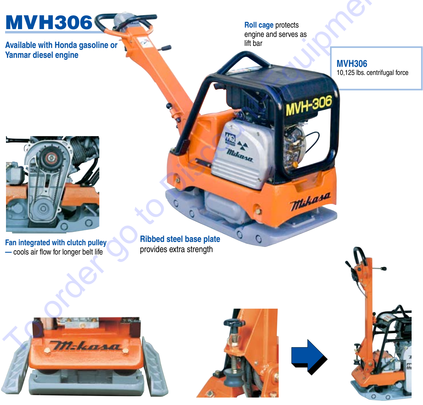
Extension plates increase working area by 6" (included with MVH306, 402, 406, 502 and 702 series models)

There are no complicated mechanical drive shafts or cables to create problems, thus greatly reducing service time and expense.