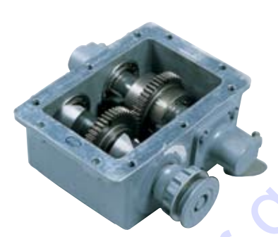
Heavy-duty vibrator bearings for long life