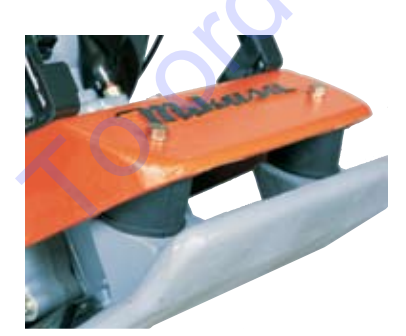
Diagonal heavy-duty shock mounts protect engine and operator from excessive vertical and horizontal vibrations