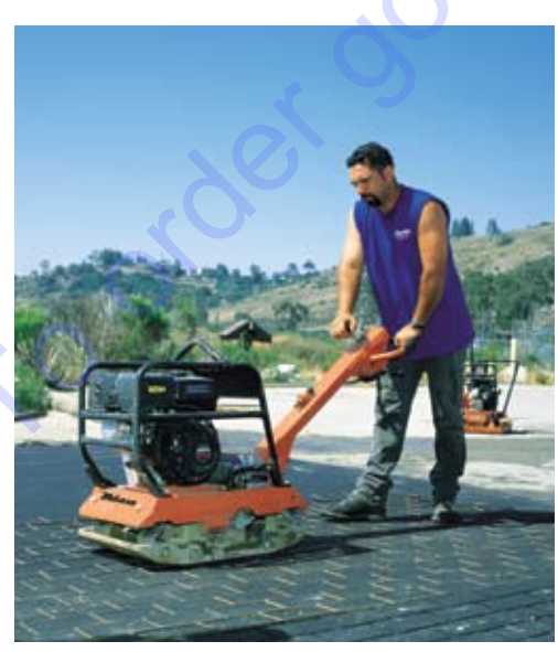
Multiquip's MVH306 is ideal for asphalt stamping jobs.

Multiquip reversible plate compactors are perfect for difficult jobsite conditions — can be backed out of a trench while still compacting