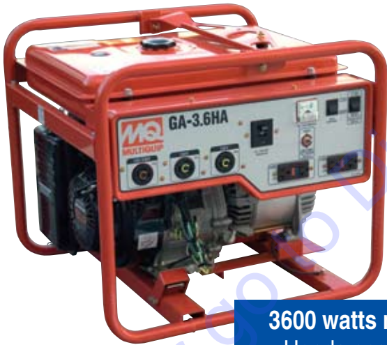
3600 watts max. Honda engine Recoil start GA36H