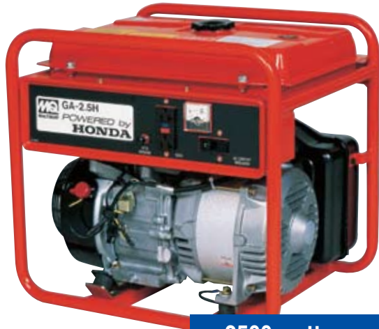
2500 watts max. Honda engine Recoil start GA25H