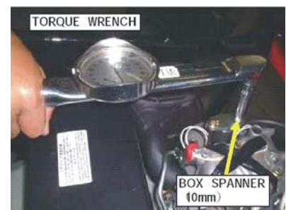
Figure 2. Torque Wrench