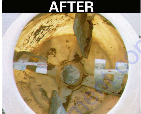
...but not with an EasyClean mixer! A few taps with a rubber mallet and the dried concrete falls right out!