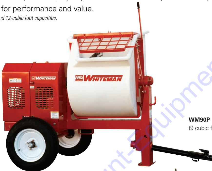
WM90P (9 cubic ft., Poly drum)

Models available in 7-, 9-, and 12-cubic foot capacities.