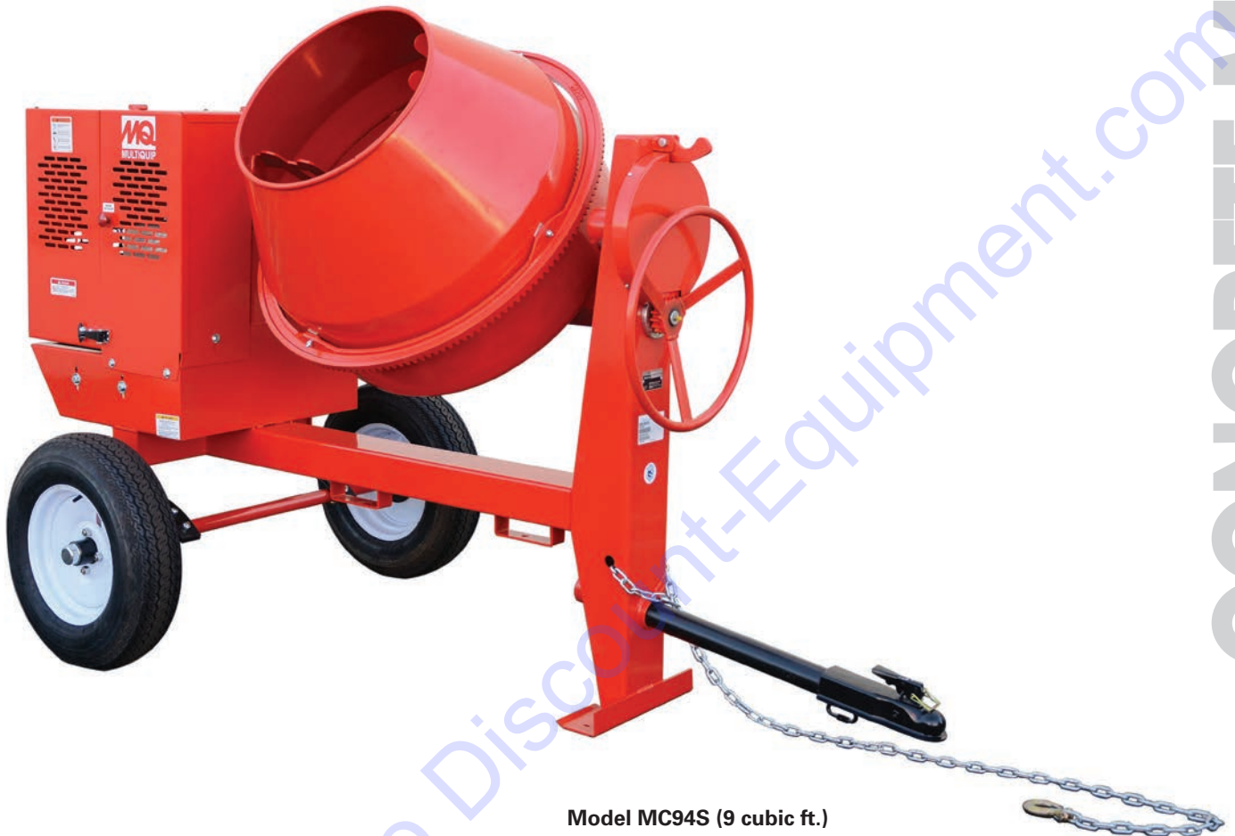
Model MC94S (9 cubic ft.)

Multiquip concrete mixers are available with either steel or polyethylene drums. Their durable construction and low maintenance requirements will provide you with years of reliable service.