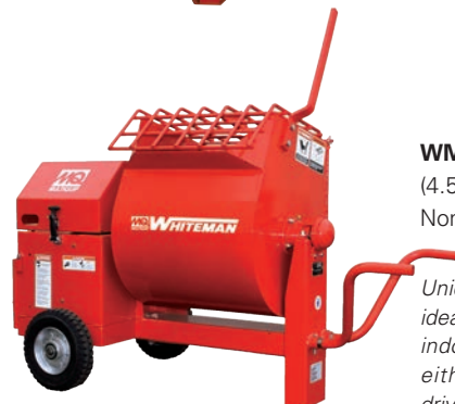
WM45 (4.5 cubic ft., Steel drum) Non-towable

Unique wheelbarrow design ideal for small batch jobs and indoor work. Available with either electric or gasoline drive.