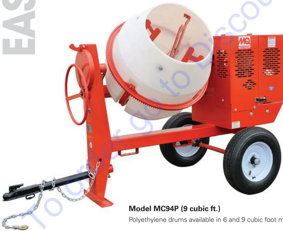
Model MC94P (9 cubic ft.)

The MC12PH concrete mixer handles your biggest and toughest applications. It features a 12 cubic ft. EasyClean™ drum and powerful Honda GX340 engine.