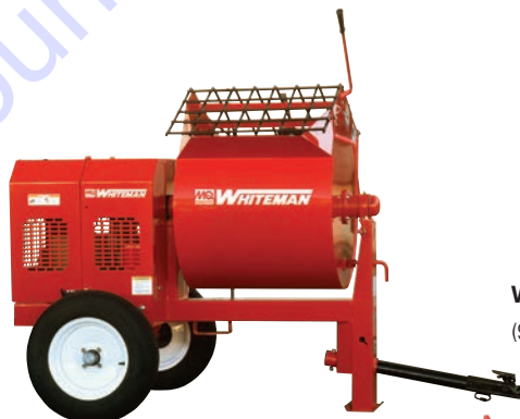
WM90S (9 cubic ft., Steel drum)