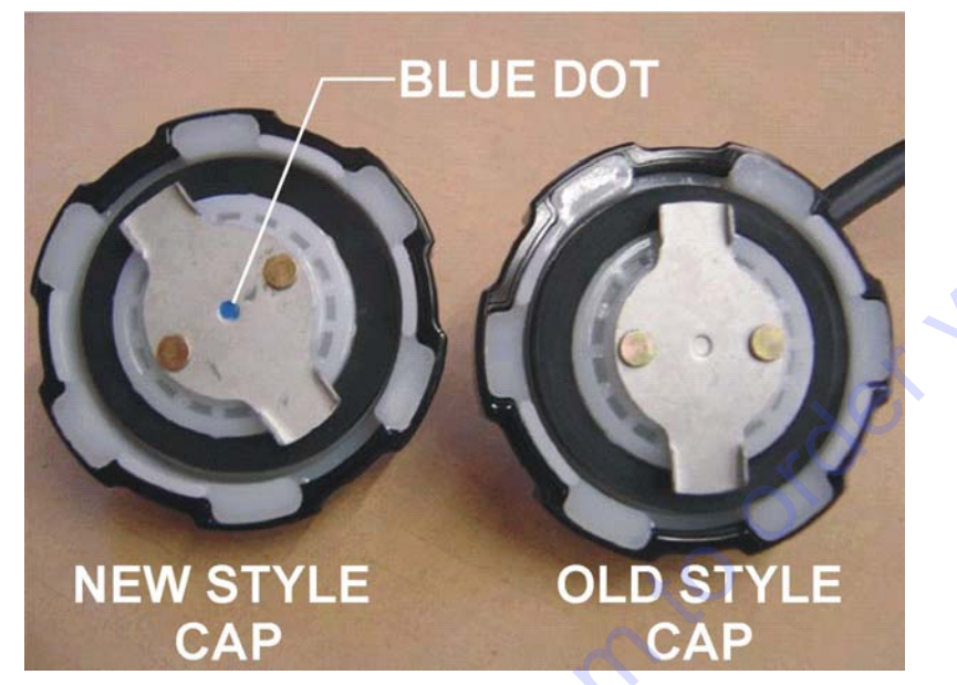
Figure 2. Fuel Cap Installation

3. Identify new fuel cap (Figure 2), blue dot on underside of fuel cap. Insert vent hose onto fuel cap vent inlet. Using pliers grip and squeeze the tabs on the retaining clamp and slide clamp upwards on the vent hose towards the fuel cap.