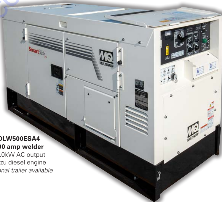
DLW500ESA4 500 amp welder 14.0kW AC output Isuzu diesel engine Optional trailer available