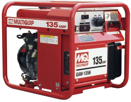
GAW135H 135 amp welder 1.5kW AC output Honda engine, recoil start

Multiquip welders deliver premium performance in sizes ranging from 135 amps to 500 amps. Whether you are looking for a gasoline-powered machine for small repairs or a large diesel-powered machine for service truck or industrial applications Multiquip has the best welders in the industry.