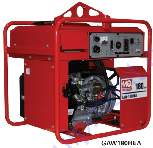
GAW180HEA 180 amp welder 3kW AC output Honda engine, recoil/electric start Battery sold separately Battery specifications: 12N243A / MQ# 0162212024