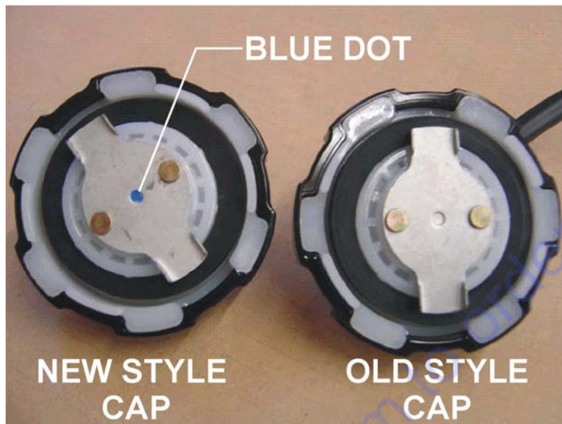
Figure 2. Fuel Cap Installation