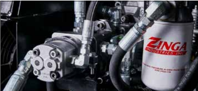
100% hydraulic drive — No V belts, pulleys, clutches or mechanical gear reductions.