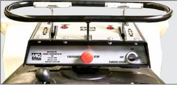
Dual control handles provide consistent tracking, easy steering, and minimized operator fatigue. (WTB-16 shown)