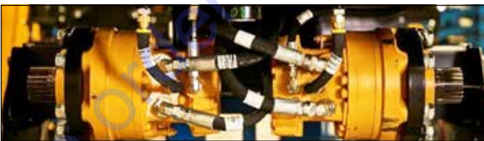
Premier high torque Poclain hydraulic motors feature fail-safe brakes.