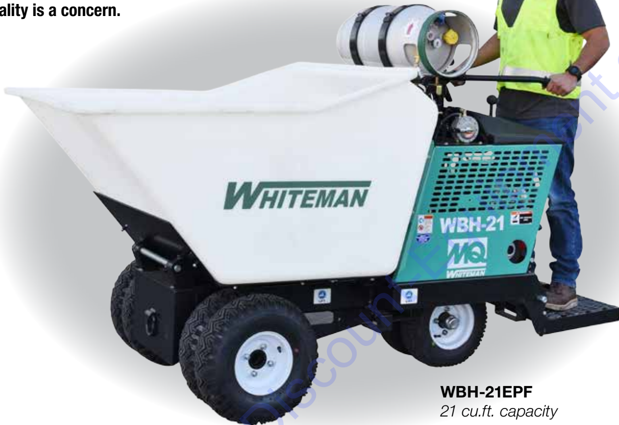
WBH-21EPF 21 cu.ft. capacity

Environmentally friendly — produces cleaner emissions and longer running time. Ideal for use indoors or in semi-enclosed buildings where air quality is a concern.