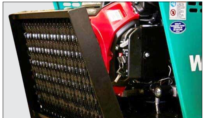
Folding foot plate allows operator to walk behind machine when used in confined areas. Perforated platform prevents material build up.