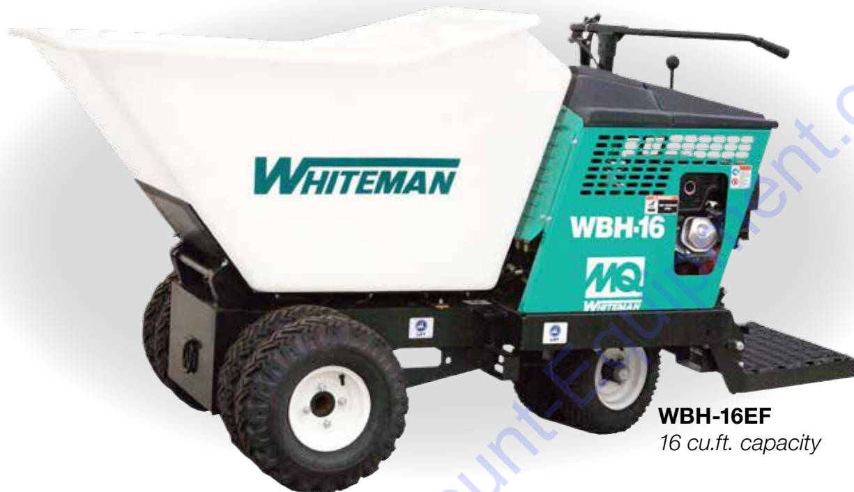
WBH-16EF 16 cu.ft. capacity