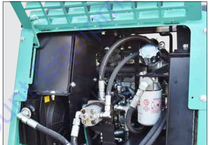
Front panel raises to provide complete service access.