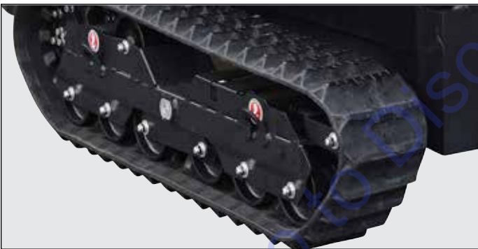
Aggressive tack pattern for use in soft soil to muddy site conditions.