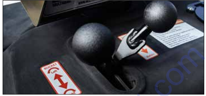
Hand and foot controls facilitate tub rotating and dumping. (WTB-16PD shown)