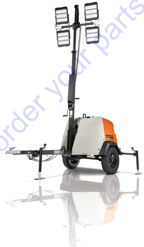
Picture shown may not reflect actual configuration.