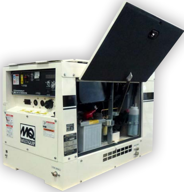
Model: DA7000SSA2GH Modified for single side serviceability

Single side service access is standard in the model DA7000SSA2GH. A factory modification relocates the oil-filter assembly and enables all service points (fuel filter, oil filter, battery, coolant, air filter and drains) to be accessed from the same side of the generator. It is recommended for applications where the generator will be permanently mounted on equipment or installed in an area with obstructed access to the cabinet.