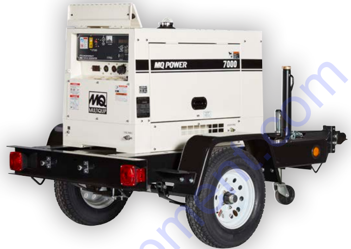
Model: DA7000SSA2 shown with optional trailer mount