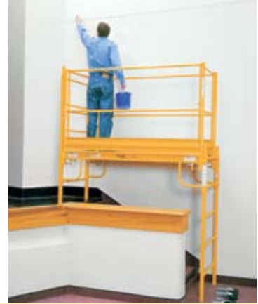
Pro-Jax units (with casters removed) can be used on stairs.