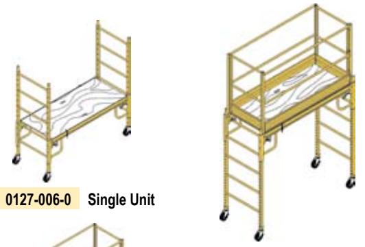
0127-006-0 Single Unit

NOTE: Guard railing is required by OSHA on all platforms 10' or higher.