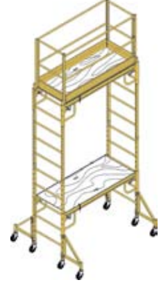
0127-006-2 2 Single Units w/ Guard Rail & 18" Wide Outriggers