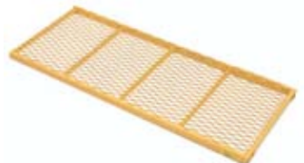
0127-113 Expanded Steel Deck