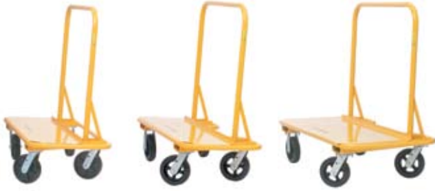
Drywall Cart DC 3000 LD

The Drywall Cart is designed to haul full capacity loads with easy maneuverability and complete stability. Support bracing is removable for easy storage and handling.