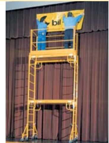
Units can be stacked for additional working height.