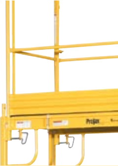
Unique design allows guard railing to stay at platform level at all times. Platform level adjusts in 2" increments.