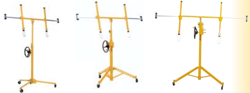
Panel-Jax Drywall Lift Model DL 100, 5'-10'

The Drywall Lift holds 4' x 12' sheets of drywall, and knock down for easy storage and handling. The winch designs use a steering wheel for easy adjustment.