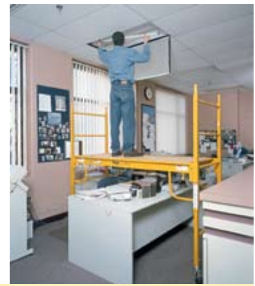
0127-006-0 shown in use over lower obstacles allowed by the span type platform arm braces.