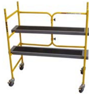
Handy Roll, 0063-0435-44, 4-caster model shown, 2 caster/end options listed below