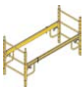
0127-007-3 39" Additional Height Unit