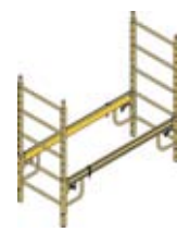
0127-007-5 65" Additional Height Unit