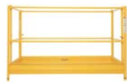
0127-149-06 6' Guard Rail Pkg.