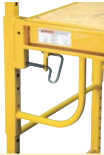
Unique Saf-T-Lok® provides added safety and is more efficient for use.