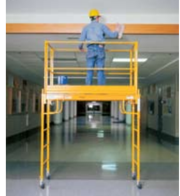
0127-006-1 shown in a maintenance application.