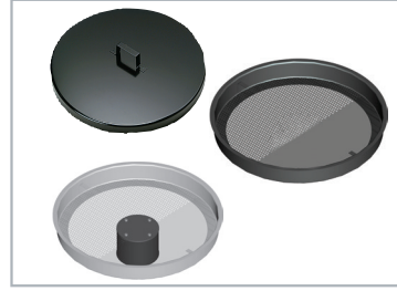
Heavy-Duty Lid, Abrasive Screen, and Umbrella

Additional air-blast equipment is available in custom packages.