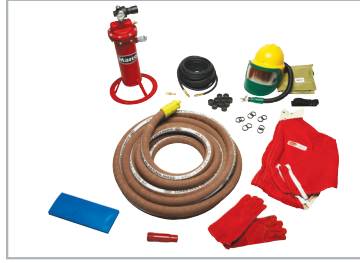
Air-Blast Pot Packages

The Extractor Moisture Separator removes excess moisture, oil, and other debris from compressed air before it enters the air-blast pot.