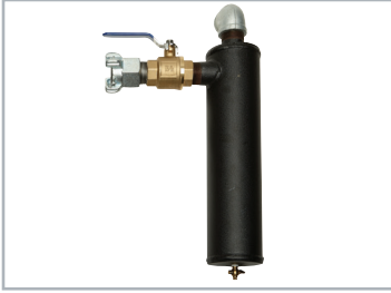
Extractor Moisture Separator

The Extractor Moisture Separator removes excess moisture, oil, and other debris from compressed air before it enters the air-blast pot.