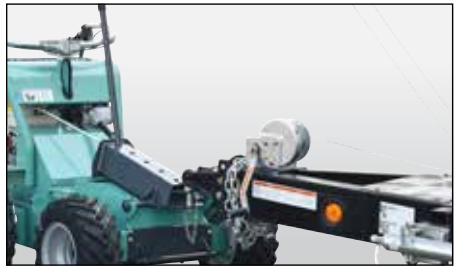
TuffTruk 2-Inch Towing Hitch — TTBH — offers various height positions for different size trailers.