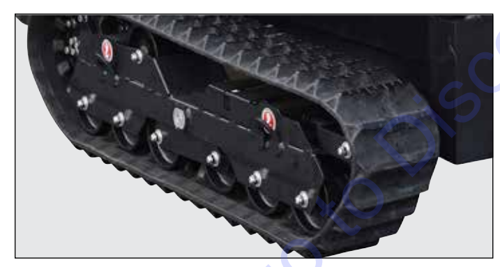
Aggressive tack pattern for use in soft soil to muddy site conditions.