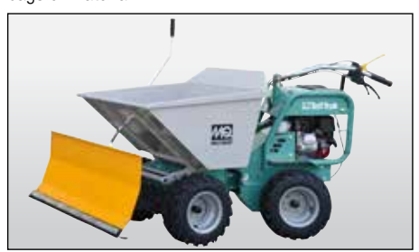
TuffTruk Snow Plow — TSP — perfect for displacing snow during poor weather conditions (offered on model TB11 only).