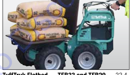
TuffTruk Flatbed — TFB33 and TFB29 — 33.4 or 29.0 inch width, ideal for transporting heavy bags of material.