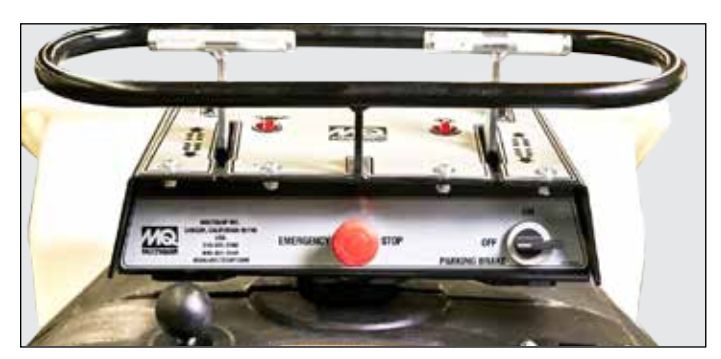
Dual control handles provide consistent tracking, easy steering, and minimized operator fatigue. (WTB-16 shown)