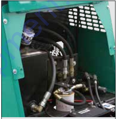
Quick Service Access Hinged access door for easy maintenance.

Hydraulic hoses are located within the frame for fast access and protection.