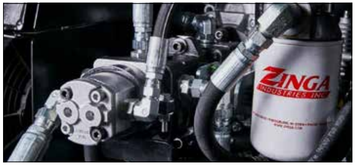
100% hydraulic drive — No V belts, pulleys, clutches or mechanical gear reductions.