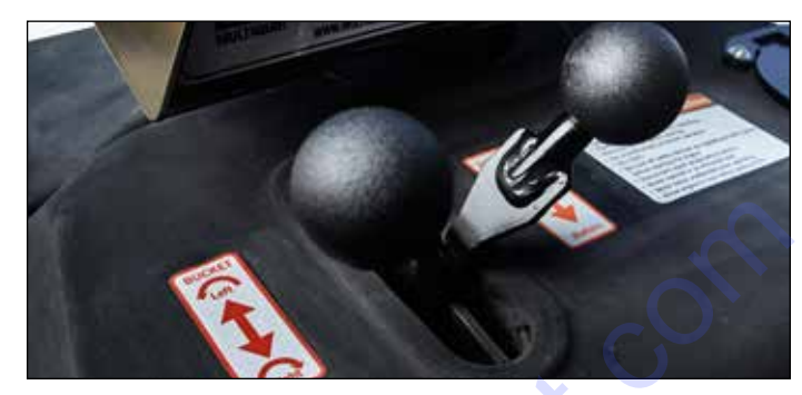
Hand and foot controls facilitate tub rotating and dumping. (WTB-16PD shown)