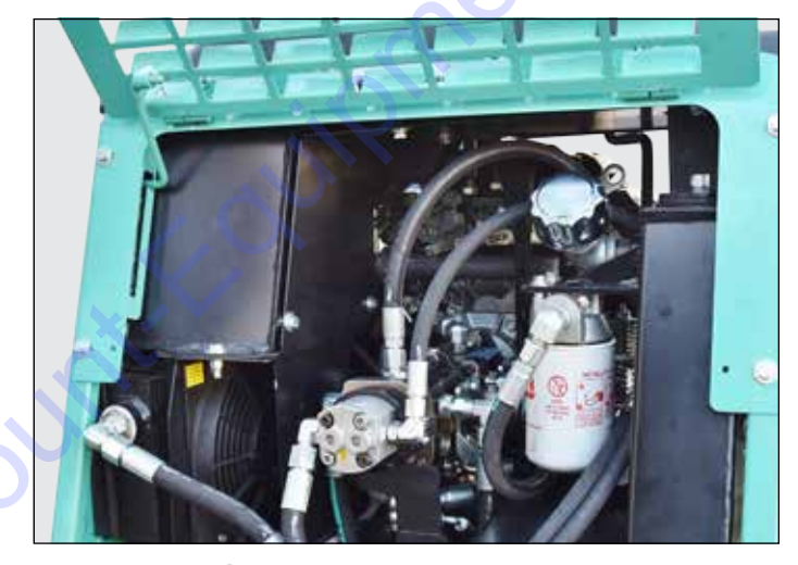
Front panel raises to provide complete service access.