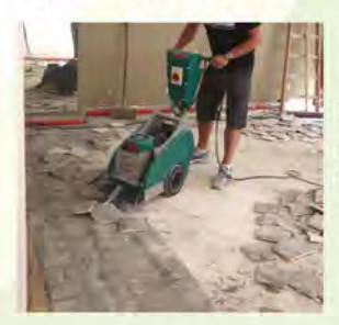
Removing ceramic tile