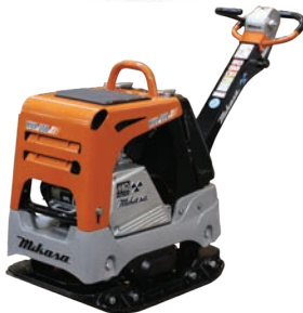
Plate size WxL in. (mm) - 19.7x28.3 (500x720) Centrifugal Force lbs. (kN) - 8,318 (37) Exciter Speed VPM - 5,200 Operating Weight lbs. (kg) - 463 (210) Max travel Speed ft/min (m/min) - 85 (26) Cyclonic Pre-Cleaner - Triple