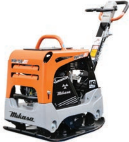
Plate size WxL in (mm) - 15.8x23.2 (400x590) Centrifugal Force lbs. (kN) - 5,283 (23.5) Exciter Speed VPM - 5,400 Operating Weight lbs. (kg) - 268 (122) Cyclonic Pre-Cleaner - Triple Optional Wheel Kit - WHL158