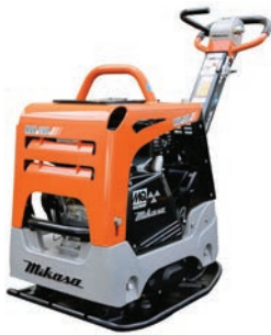
Plate size WxL in (mm) - 16.9x27.6 (430x700) Centrifugal Force lbs. (kN) - 6,070 (27) Exciter Speed VPM - 5,400 Operating Weight lbs. (kg) - 308 (140) Cyclonic Pre-Cleaner - Triple Optional Wheel Kit - WHL158