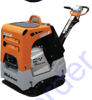
Plate size WxL in (mm) - 24x34 (600x860) Centrifugal Force lbs. (kN) - 9,442 (42) Exciter Speed VPM- 4,400 Operating Weight lbs. (kg) - 794 (360) Max travel Speed ft/min (m/min) - 79 (24) Cyclonic Pre-Cleaner - Single