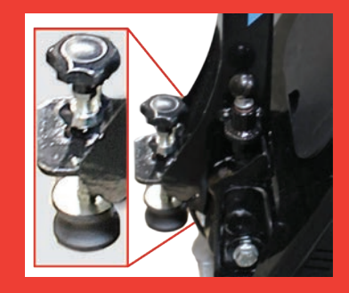
Adjustable handle height reduce operator fatigue and improves comfort.