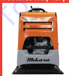
Extension Plates - increase working area by 6".