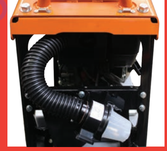
Cyclonic pre-cleaner - significantly reduces maintenance frequency and prolongs maximum efficiency of engine.