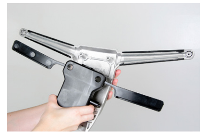
The simple modular switch design promotes fast and easy repairs to minimize maintenance costs.