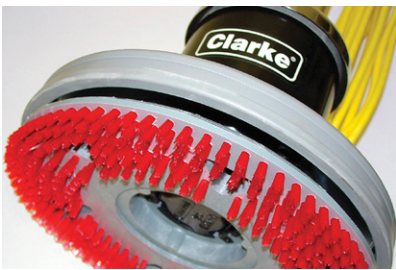
Short cut bristle pad driver comes standard with polisher.