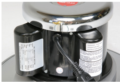
Powerful motors in both 1 hp and 1.5 hp have dual capacitors to maximize startup and run torque.