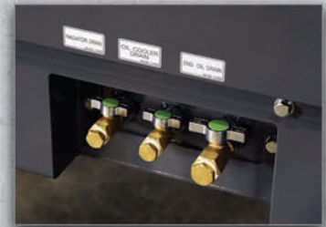
12 | Exterior Service Drains Quick drain valves for the Radiator, Oil Cooler and Engine Oil fluids