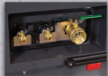
3 | Air Connections 3/4" Ball Valve x 2 | 2" Ball Valve x 1