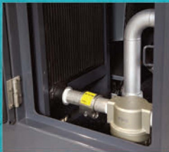
Integrated After Cooler