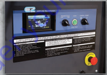
1 | Digital Touch Screen Control with Start Button & Pressure Selector Switch