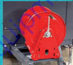
Single Hose Reel Kit