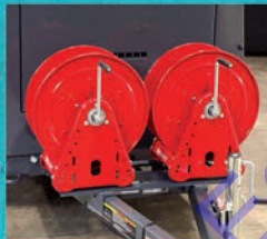
Double Hose Reel Kit