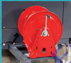
Single Hose Reel Kit