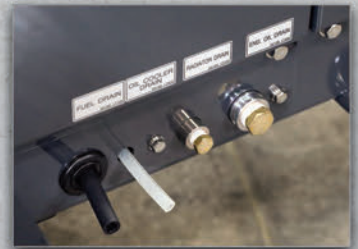
11 | Exterior Service Drains Quick drain valves for Fuel, Oil Cooler, Radiator and Engine Oil fluids