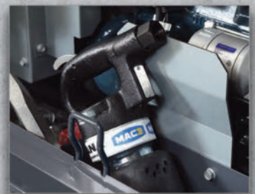
6 | Interior Storage Compartment Holds a 90# breaker or other air tools