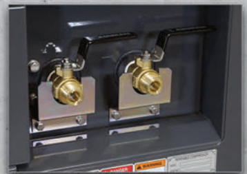
3 | Air Connections 3/4" Male Ball Valve x 2