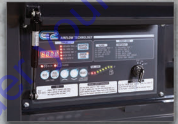
1 | Keyed Start and Digital Monitor with Eco and Eco Auto Idling Modes