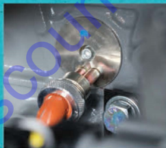
Engine Block Heater