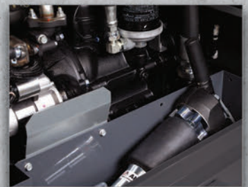
6 | Interior Storage Compartment Holds a 90# breaker or other air tools