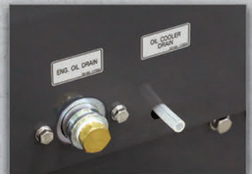
11 | Exterior Service Drains Quick drain valves for Engine Oil and Oil Cooler fluids