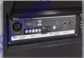
1 | Keyed Start and Digital Monitor with Auto Idle Mode