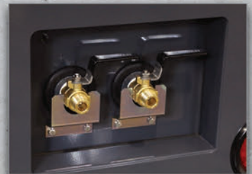
2 | Air Connections 3/4" Male Ball Valve x 2