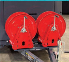
Double Hose Reel Kit