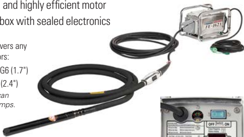
FU162A Control Panel

* Only ONE FX60E6 can be powered at 18 Amps.