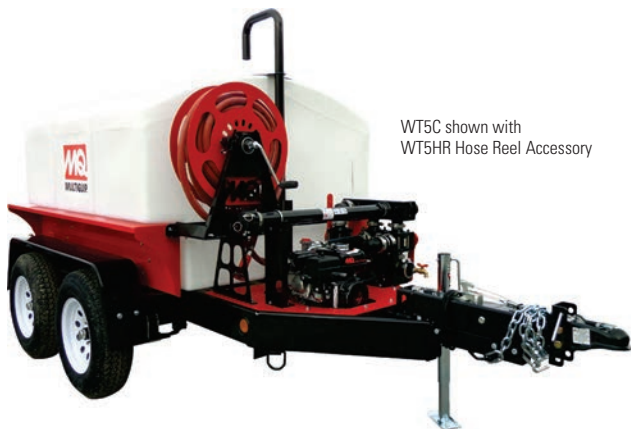
WT5C shown with WT5HR Hose Reel Accessory