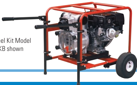
Wheel Kit Model UWKB shown

Industrial towable trailers with fuel cells are available for QP4TK, MQ62TK and MQ600HT models.