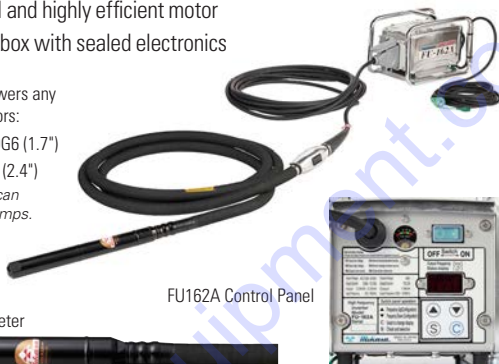
FU162A Control Panel

* Only ONE FX60E6 can be powered at 18 Amps.