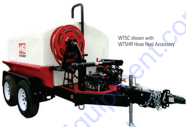
WT5C shown with WT5HR Hose Reel Accessory