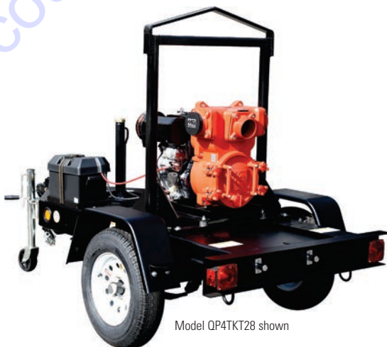
Model QP4TKT28 shown