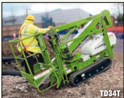
Available on rubber-free urethane tracks.