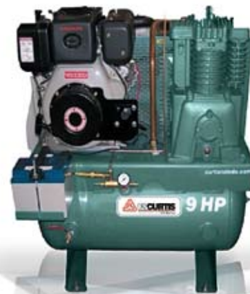
9E2GT3-YB 9HP tank mounted Yanmar diesel driven