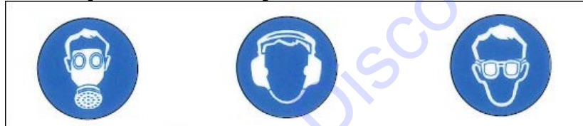
wear breathing mask