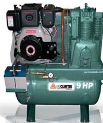
9E2GT3-YB 9HP tank mounted Yanmar diesel driven