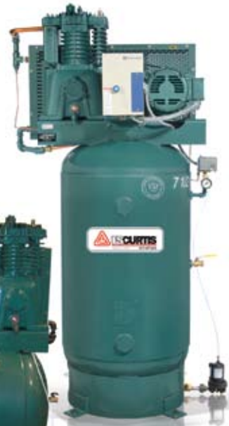
7E2VT8UP Simplex UltraPack

FULLY PACKED WITH ALL THE OPTIONS YOU NEED