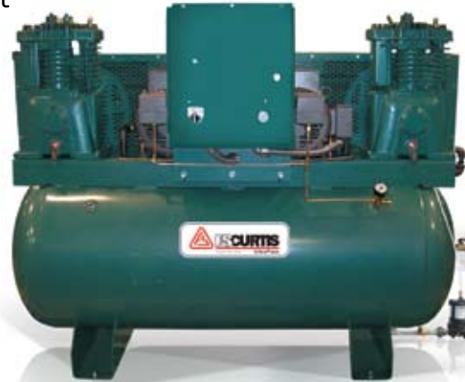
7E2HDT12UP Duplex UltraPack