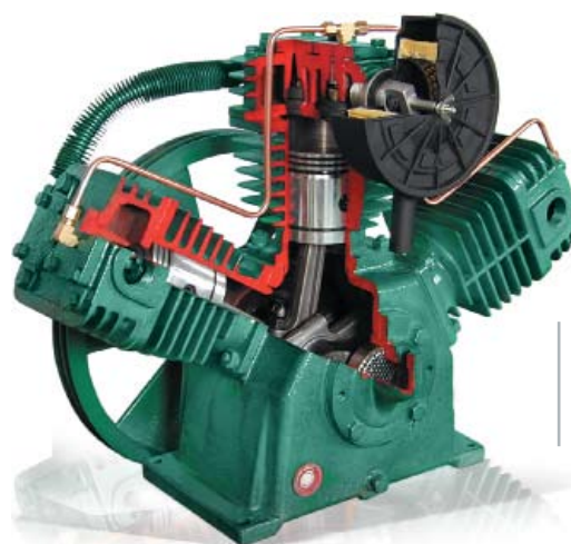
Cutaway Illustration for model E-50 Basic Pump

Quality and industrial durability are built into each cast iron pump to give you a solid return on your compressor investment. Engineered to last - heavy cast iron construction. Serious protection - comes standard with ductile iron crankshafts, high strength metal connecting rods, rod insert bearings, wrist pin bushings, high-capacity hardened and lapped stainless steel valves with suction valve head unloaders. Efficiency - maximum CFM output per energy dollar.