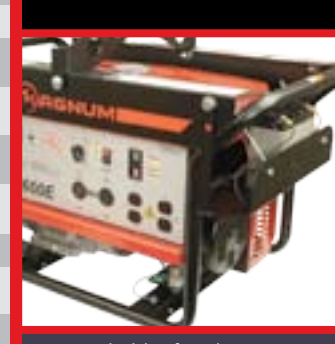
Battery holder for electric start models stores within the framework, conserves space & adds protection from jobsite damage.