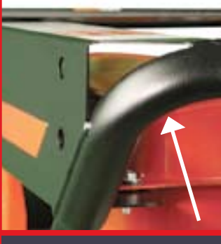
Heavy duty 1.25" tubular steel frame for added protection and durability