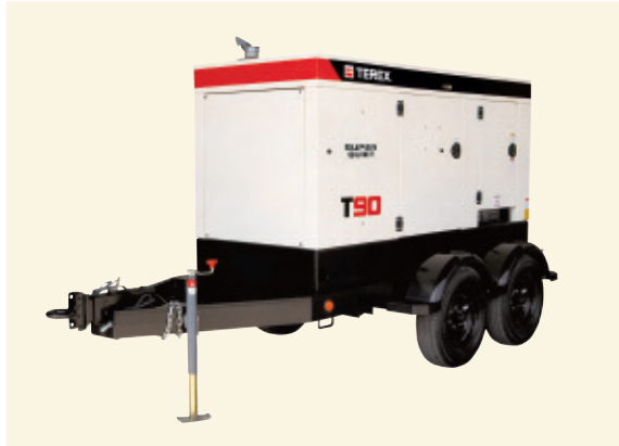
The T90 Super Quiet Generator offers a prime output rating of 90 kVA, 66 dBA sound level and 196 gal (742 L) fuel capacity.