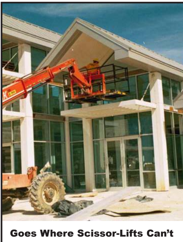
Goes Where Scissor-Lifts Can't