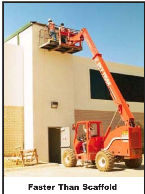
Faster Than Scaffold