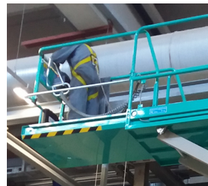
Driveable at full height and fully extended