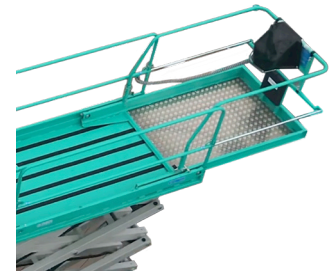
Manual deck extension of 51" 510 lb Capacity Number of Occupants - 2 / 3