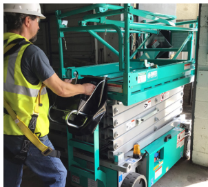
Narrow platforms and foldable guardrails allow for easy access through standard doorways