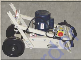
FOLDED STORAGE AND/OR TRANSPORT POSITION

IDEAL FOR: Removing vinyl tile, linoleum tile, VCT and carpeting (When Air-powered Chisel Scalers or TS-14 are not options, the TS-8 TileShark can be used on 4" ceramic tile)