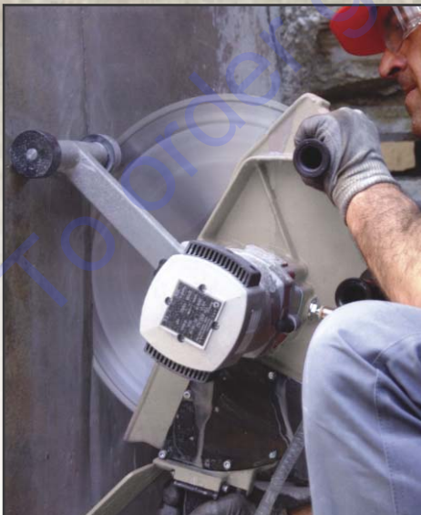
MAX CUTTING DEPTH 6"