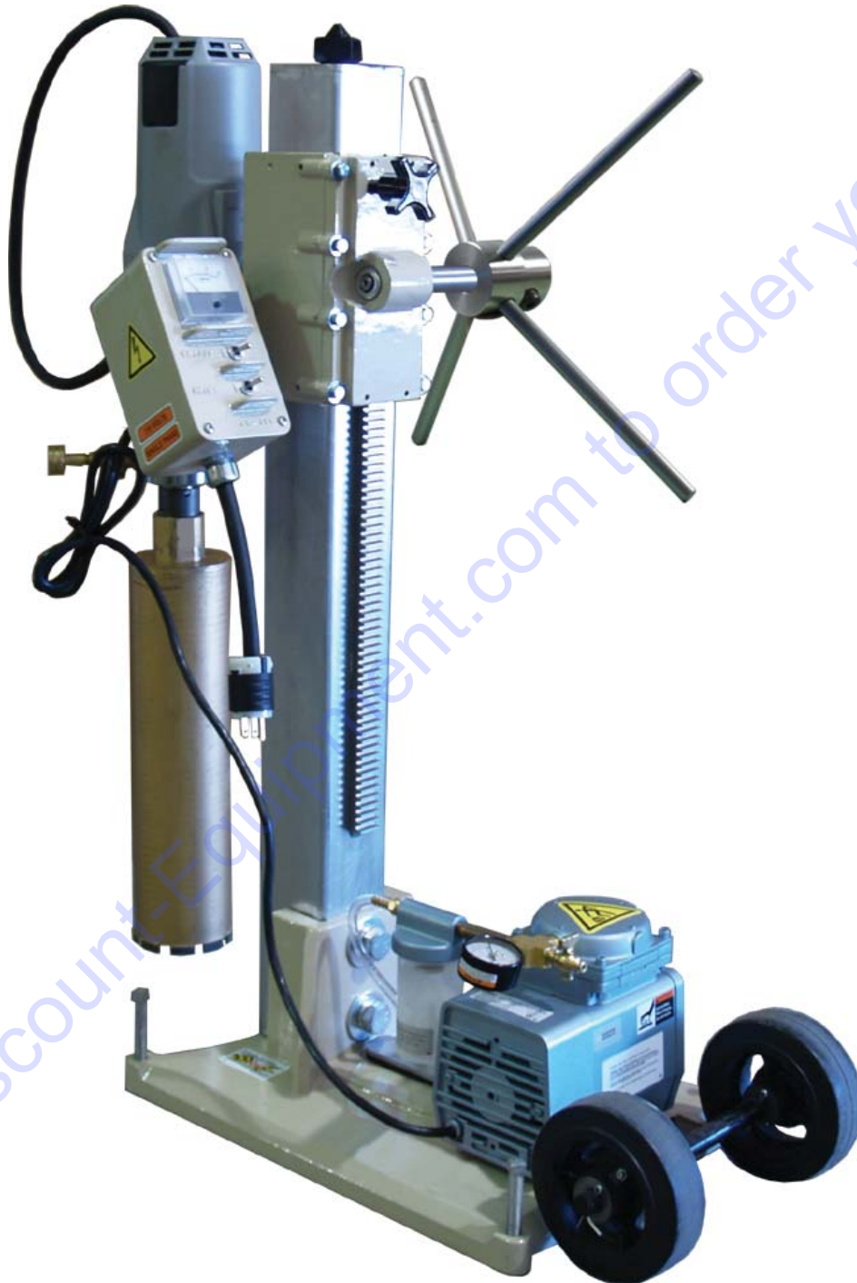
Manual - Portable