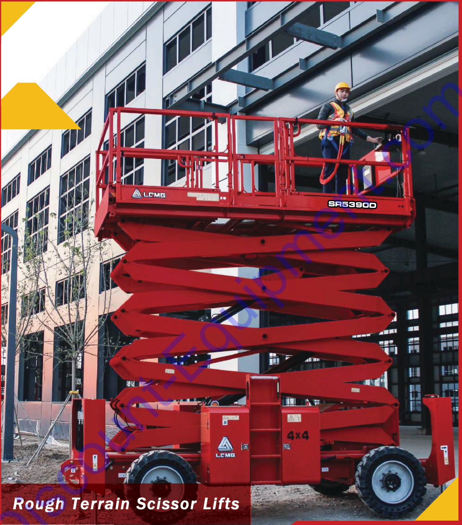
Rough Terrain Scissor Lifts