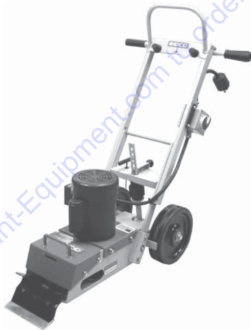
Model TS-8 Part No. 94400