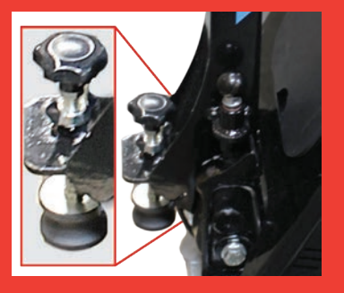
Adjustable handle height reduce operator fatigue and improves comfort.