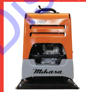
Extension Plates - increase working area by 6".