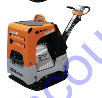
Plate size WxL in (mm) - 24x34 (600x860) Centrifugal Force Ibs. (kN) - 10,116 (45) Exciter Speed VPM- 4,400 Operating Weight Ibs. (kg) - 794 (360) Max travel Speed ft/min (m/min) - 79 (24) Cyclonic Pre-Cleaner - Single