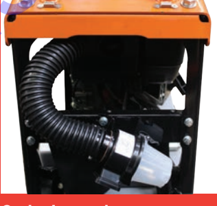
Cyclonic pre-cleaner significantly reduces maintenance frequency and prolongs maximum efficiency of engine.