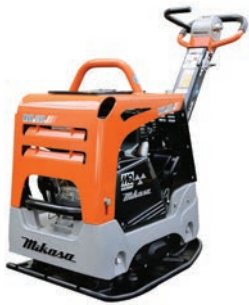
Plate size WxL in (mm) - 16.9x27.6 (430x700) Centrifugal Force lbs. (kN) - 6,070 (27) Exciter Speed VPM - 5,400 Operating Weight lbs. (kg) - 308 (140) Cyclonic Pre-Cleaner - Triple Optional Wheel Kit - WHL158