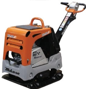
Plate size WxL in. (mm) - 19.7x28.3 (500x720) Centrifugal Force lbs. (kN) - 8,318 (37) Exciter Speed VPM - 5,200 Operating Weight lbs. (kg) - 463 (210) Max travel Speed ft/min (m/min) - 85 (26) Cyclonic Pre-Cleaner - Triple