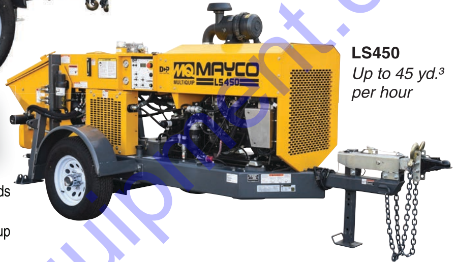
LS450 Up to 45 yd. 3 per hour