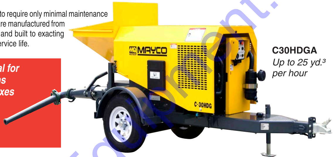
C30HDGA Up to 25 yd. 3 per hour

Mayco replacement parts are reasonably priced and readily available. Additionally, our nationwide network of dealers is ready to provide service and technical support no matter where your job is located.