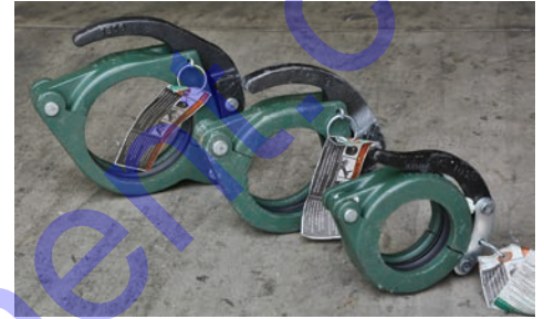
Multiquip uses conforms couplers