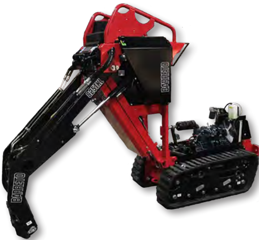
Cab-over design provides easy access to the engine, hydraulic pumps and components

The TKL experience incorporates an electronic display panel that is clear and easy to understand. Featuring a unique High/Medium/Low speed selection, the operator can adjust the track drive speed of the TKL to the task at hand, benefiting both seasoned and novice operators. There are a variety of safety features on the TKL, including the Operator Presence Switch that senses when the operator is no longer standing on the ride platform. The TKL is also equipped with innovative Tip Over Protection, utilizing the machine's incline sensor to shut off the fuel supply and lock the TKL in the event of a rollover situation. A 4-digit safety code is required to restart the TKL, preventing potential engine damage and giving the owner opportunity to inspect and secure the machine.