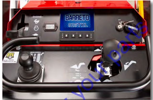
Electronic display panel and user-friendly controls

The 825TKL Mini Track Loader features an innovative cab-over design, allowing exceptional access to key components, cutting routine maintenance time, and improving your bottom line. The articulating rollers on the track system tackle uneven terrain and absorb impact, providing stability and comfort to the operator. The universal attachment plate on the TKL allows for the use of any industry-standard quick-change attachment, providing value by eliminating the unnecessary cost of brand-specific attachments.