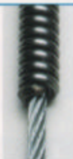
Genuine galvanized aircraft wire inner core for longer life.

Optional wheel cart available for easy transport.