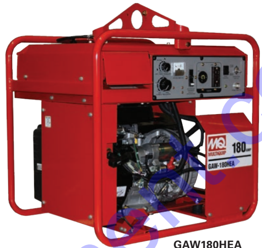
GAW180HEA 180 amp welder 3kW AC output Honda engine, recoil/electric start Battery sold separately Battery specifications: 12N243A / MQ# 0162212024