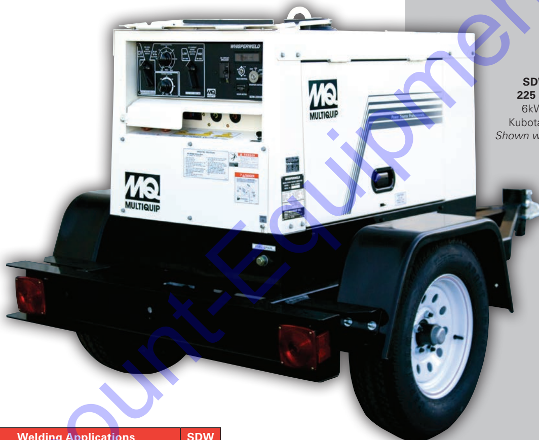
SDW225SSA1 225 amp welder 6kW AC output Kubota diesel engine Shown with optional trailer

Full instrumentation is protected by a lockable cover panel. Controls for both CC and CV welding, along with engine condition indicators, are included.