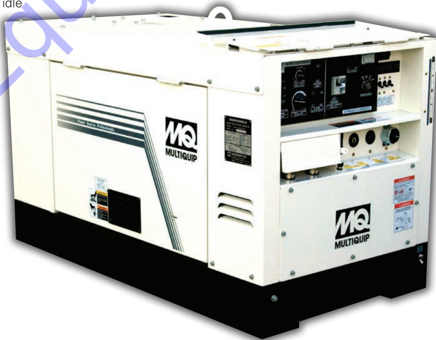
DLW300ESA1 300 amp welder 10.5kW AC output Kubota diesel engine