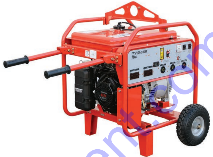
GA36HR 3600 watts max. Honda engine, recoil start