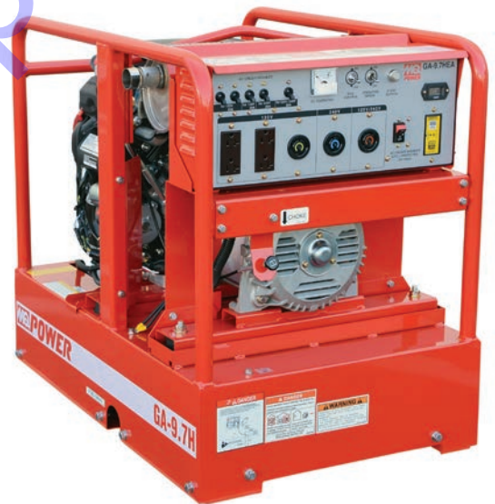
GA97HEA 9700 watts max. Honda engine, electric start Battery Specifications: 38B19R / MQ# Y0165103819