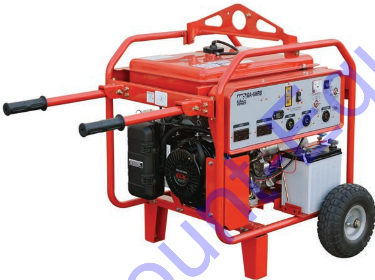
GA6HRS 6000 watts max. Honda engine, recoil/electric start Battery sold separately Battery specifications: 12N243A / MQ# 0162212024