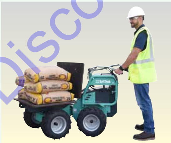
Shown with TuffTruk Flatbed accessory.