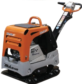
Plate size WxL in. (mm) - 19.7x28.3 (500x720) Centrifugal Force lbs. (kN) - 8,318 (37) Exciter Speed VPM - 5,200 Operating Weight lbs. (kg) - 463 (210) Max travel Speed ft/min (m/min) - 85 (26) Cyclonic Pre-Cleaner - Triple