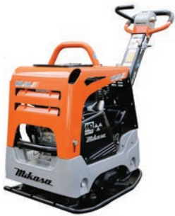
Plate size WxL in (mm) - 16.9x27.6 (430x700) Centrifugal Force lbs. (kN) - 6,070 (27) Exciter Speed VPM - 5,400 Operating Weight lbs. (kg) - 308 (140) Cyclonic Pre-Cleaner - Triple Optional Wheel Kit - WHL158