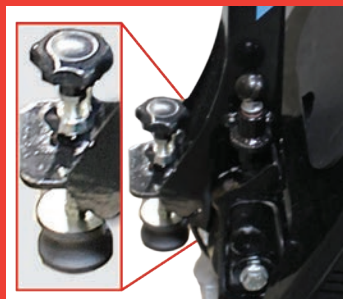
Adjustable handle height - reduce operator fatigue and improves comfort .