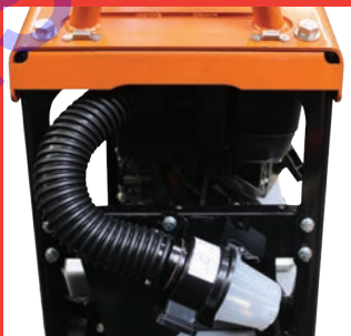
Cyclonic pre-cleaner - significantly reduces maintenance frequency and prolongs maximum efficiency of engine.