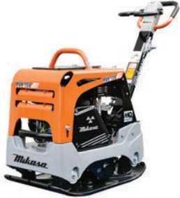
Plate size WxL in (mm) - 15.8x23.2 (400x590) Centrifugal Force lbs. (kN) - 5,283 (23.5) Exciter Speed VPM - 5,400 Operating Weight lbs. (kg) - 268 (122) Cyclonic Pre-Cleaner - Triple Optional Wheel Kit - WHL158