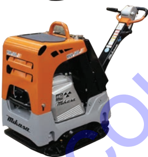
Plate size WxL in (mm) - 24x34 (600x860) Centrifugal Force lbs. (kN) - 10,116 (45) Exciter Speed VPM - 4,400 Operating Weight lbs. (kg) - 794 (360) Max travel Speed ft/min (m/min) - 79 (24) Cyclonic Pre-Cleaner - Single